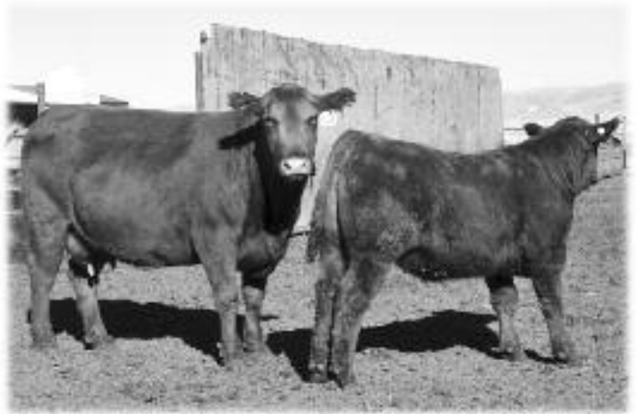
Buffalo Creek P126 • Lot 83

Pasture Exposed to X180, Lot 3, 6/10 - 9/15. Bull Calf at side, Y001, sired by BUF CRK Lancer R017. Born 4/27 BW 82. WW 590. A very solid daughter of Patriot M183, a Lancer F442 son out of our great Amber 3912 cow that is now at Michael & Lindsay Booth's in Wyoming. P126 has progeny records of: BW: 6/75 WR: 5/101 YR: 5/102 MPPA: 100.8. M105, the MGD, is a maternal sib to BUF CRK Medallion N328, Ref.Sire G-1. P126's first four calves were all heifers retained in the herd, then sold in our