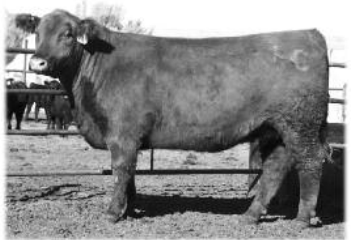
Buffalo Creek W058 • Lot 80

A beautiful Cherokee sired daughter that is an ET. Her dam was an amazing cow that produced under range conditions through the age of sixteen. 2373's record is: BW: 15/79 WR 14/104 YR: 14/103 MPPA: 104.0. Embryos that are full sibs to W058 sold in our Dispersal Sale to Stacy Davies.