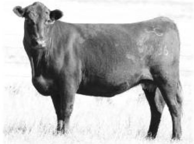
Buffalo Creek T236, dam of Lot 89

This line of cows traces back to our Lass 2570 cow, one of Dynamo 732's (Ref.Sire D) great daughters. Cupid, her MGS, is an OSF son of Romeo, and the great 9109 cow. 9109 shows up again on the topside of the pedigree as dam to Lancer M328, (Ref.Sire L-1) a really solid, no fault F442 son. The dam, T236 sold in our Dispersal to Lanny Greenhalgh, one of that sale's vol-