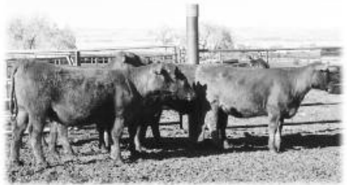
19.06. This heifer is in the top 9% for HPG and top 5% for Marbling, with a IMF ratio of 122!