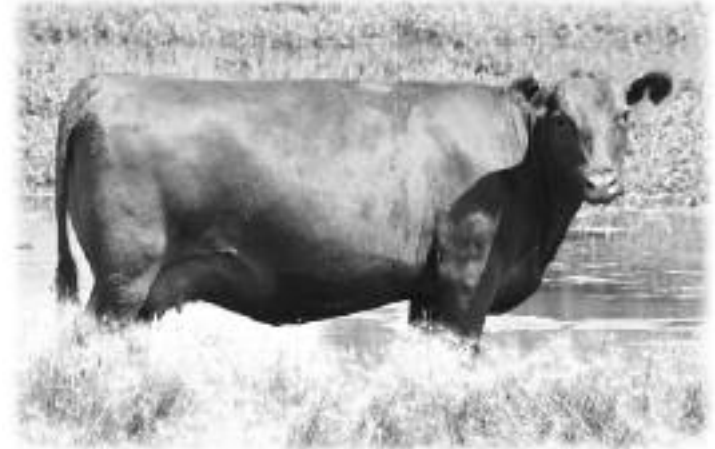
Buffalo Creek R031, dam of Lot 86