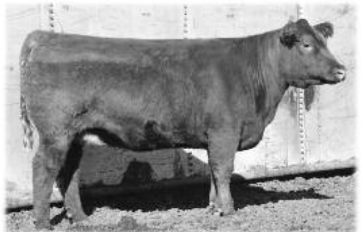
Buffalo Creek W039 • Lot 81

N036, the dam to this heifer, is a full sib to BUF CRK Romeo L081. Owned with the R2 Ranch in Texas, N036 is the dam of BUF CRK Lancer R017, sire to one of the most impressive groups of bulls to sell in 2010. An ET, sired by Cherokee Teton N316, this heifer is a half sib to the Juliet heifers that sold in our Dispersal @$4000 to Sand Dune Cattle Co.