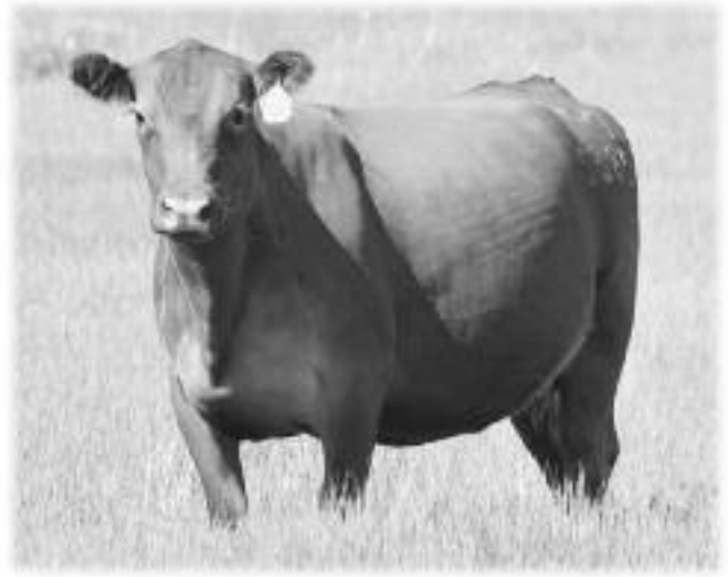
Buffalo Creek S380, dam of Lot 85

This good heifer is a red daughter of the powerful, big spread sire P178, Ref.Sire JL-1, and is in the top 8% of the breed for Direct Calv. Ease, top 16% for CEM, top 6% for Stayability and top 9% for Marbling. She ratioed 120 on her IMF scan. Her beautiful dam sold in our Dispersal to Calvo Family Red Angus.