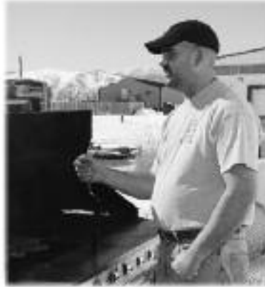
Butch grilling hamburgers