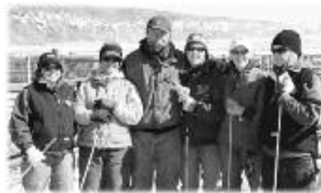
Buffalo Livestock crew