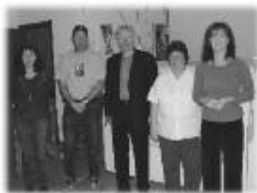
The Artcraft Crew