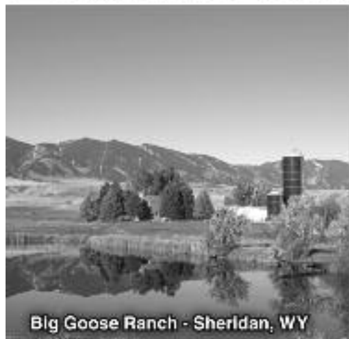
Big Goose Ranch - Sheridan, WY