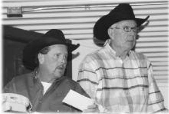
Buffalo Livestock Auction