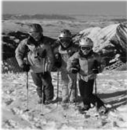
Wagners on Lone Peak