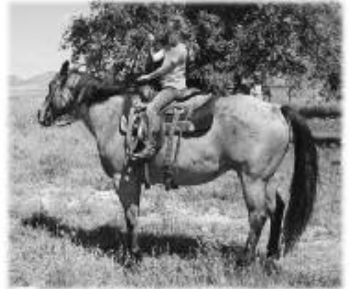
Eleanor on Cham!