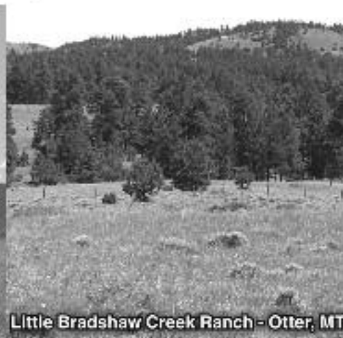
Little Bradshaw Creek Ranch - Otter, MT