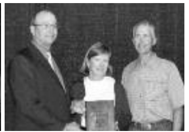
2005 • BIF Pioneer Breeder