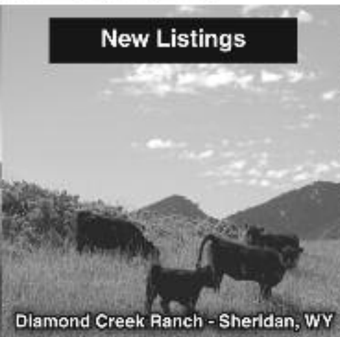
Diamond Creek Ranch - Sheridan, WY